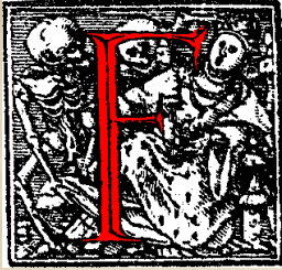
FIGURE OF THE WEEK